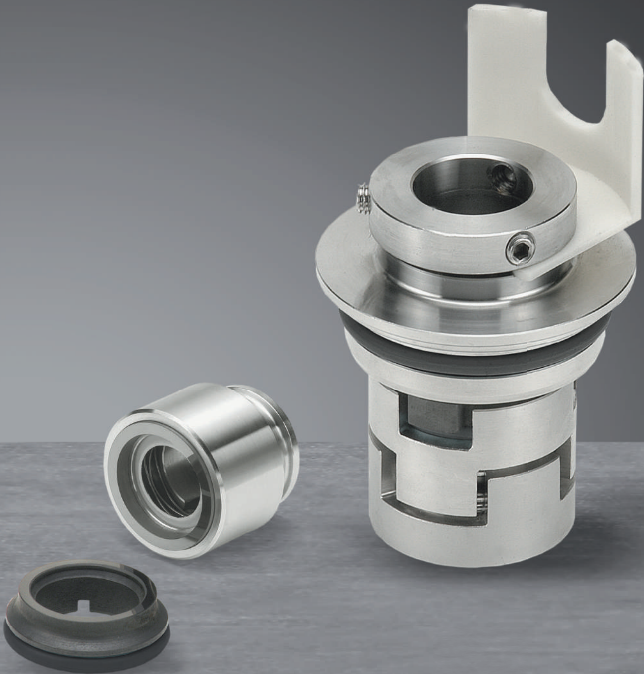
RMS Mechanical Seals